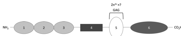
Fig. 3 Structure of high-molecular-weight kininogen. Domains 1, 2 and 3 are cystatin-like domains, with 2 and 3 having a cysteine protease inhibitor activity; domain 4 is bradykinin and another peptide; domain 5 is the surface-binding domain containing the histidine-rich region that binds GAGs and \text{Zn}^{2+} ; domain 6 is the domain binding prekallikrein and activated coagulation factor XI.

HMWK is a single chain protein that consists of 6 domains, one of which, domain 5, contains a HRR (Fig. 3). 54 Kallikrein cleaves domain 4 of HMWK, releasing bradykinin and another peptide,