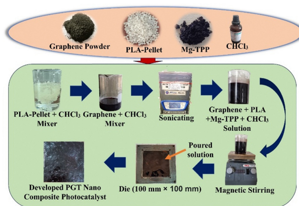
Scheme 4 Synthesis of the PGT nanocomposite flexible artificial leaf photocatalyst.

final solid precipitate of Mg-TPP was obtained. The product was rinsed with distilled water and left to dry (Scheme 3). 94,95