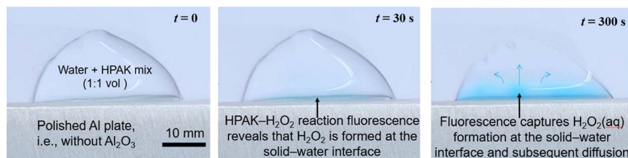
Fig. 3 Time-dependent formation of \text{H}_2\text{O}_2(\text{aq}) in a macroscopic droplet of a 1 : 1 mixture of water and HPAK reaction mixture on an Al plate (see ESI Movie S1†). Within seconds, \text{H}_2\text{O}_2(\text{aq}) formation at the Al–water interface is evident, proving that the size of the droplet and air–water interface do not matter. The solid–water interface drives this chemical transformation. The Al surface is superhydrophilic, and water spreads on it as a film. Therefore, the Al plate was placed vertically on a polystyrene sheet and formed a 1 ml droplet resting on the Al edge. The 1 : 1 mixture of water and HPAK reaction on polystyrene did not yield the faintest blue fluorescence visible to the naked eye.

Following the XPS study, we noticed that the \text{H}_2\text{O}_2 formation was accompanied by surface oxidation. Therefore, we got curious whether it was due to the reduction of the dissolved oxygen. 61 To examine this, we first removed dissolved \text{O}_2 from the water by heating it in an autoclave to its boiling point, followed by \text{N}_2(\text{g}) bubbling for 45 minutes and then sealing it inside an \text{N}_2 -purged container (methods). This treatment