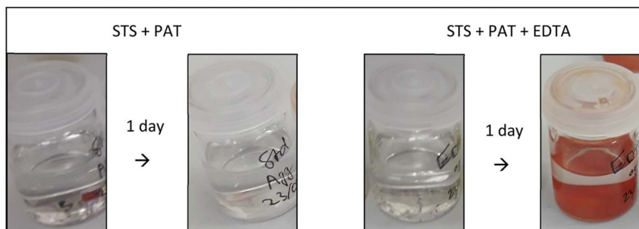
Fig. 4 Vials of \text{Sb}_2\text{S}_3 precursors sodium thiosulfate (STS) and potassium antimony tartrate (PAT) in water (left), and EDTA + STS + PAT in water (right), showing that upon addition of EDTA, a red powder forms over time in ambient conditions. Reproduced from ref. 59 with permission from Royal Society of Chemistry, copyright 2025.

Ultimately, we presented a generally applicable methodology for preventing the formation of \text{Sb}_2\text{O}_3 in antimony chalcogenide solar cells through pH control. The performances of the