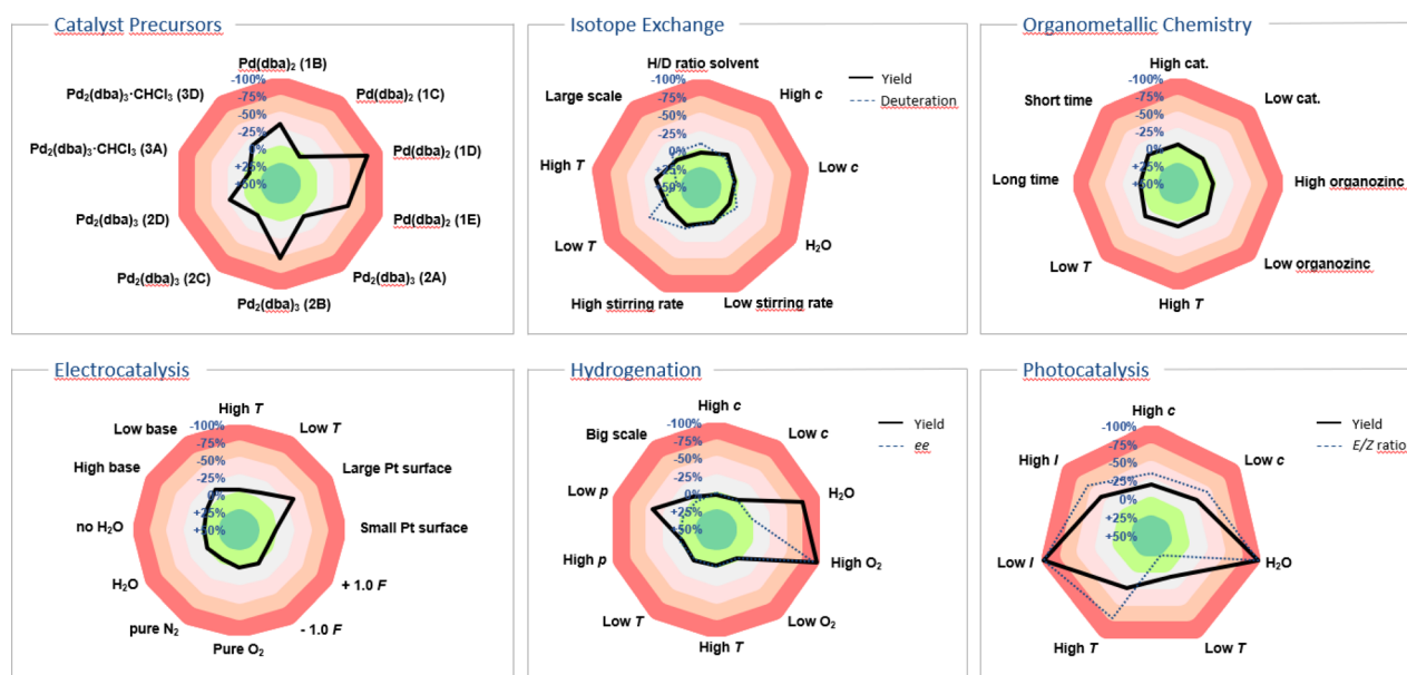
Fig. 2 Examples showcasing sensitivity screens tailored to diverse research fields. 13–16 In instances like hydrogenation, isotope exchange and photocatalysis the sensitivity screen was utilised to illustrate two target values, such as yield/deuterium incorporation, yield/enantiomeric excess and yield/ E:Z ratio, along with the parameters' impact on them.

Our innovation was embraced by the scientific community and has since been widely adopted for applications beyond the originally suggested ones. Originating from a background in photochemistry, we initially considered only yield as the target value and parameters such as: temperature, concentration, oxygen and moisture levels, light intensity, and scale. The use of the sensitivity screen within the scientific community, including our own group, has led to its adoption modified with additional parameters and target values. While the target value was formerly only yield, researchers have suggested and applied conversion, product ratio, selectivity, ee, throughput, TON, radiochemical yield (RCY), molar/specific activity ( A_m/A_s ), H/D -ratio, purity, space-time yield and enzyme activity, 12 and the standardisation of these terms has been a central achievement of the chemical community (Fig. 2). 13–16 Especially for industrial processes with more than one desired product, the reaction can be steered towards a customised product distribution, which might alter given the demand of the chemical product. A radar