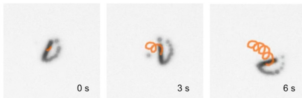
C Time lapse of \text{MnO}_2/\text{Lac} micromotor trajectories at 2 wt. % \text{H}_2\text{O}_2