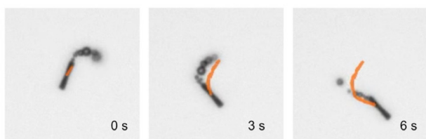
C Time lapse of \text{MnO}_2/\text{Lac} micromotor trajectories at 2 wt. % \text{H}_2\text{O}_2