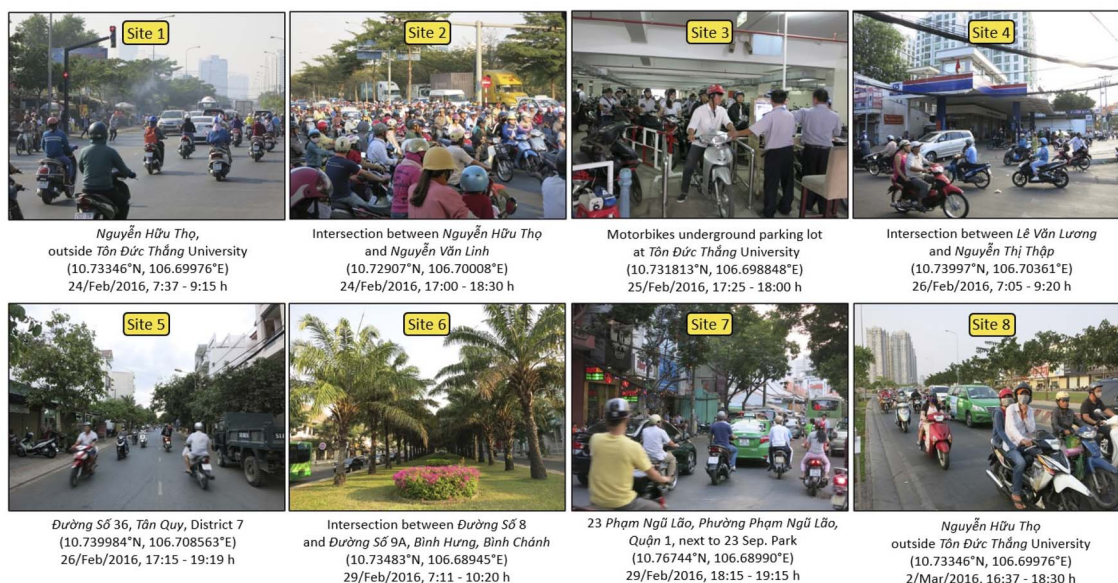
Fig. 1 Measurement sites. Except for site #3 that was only affected by motorbike emissions, all sites were also affected by emissions from passenger cars to a lesser extent. Large diesel trucks were only observed at site #2, and public buses at sites #4 and #7. Contributions from street food stalls and trash burning were experienced at all sites, to a greater extent at sites #1 and #8. The ESI includes a map (Fig. ESI1†) indicating the location of the measurement sites within HCMC urban sprawl.

(CO) mixing ratios were also measured as a tracer of traffic emissions during the street level measurements. We used relationships between pPAHs concentration and ASA as fingerprints of particles originated from combustion sources. 35,36 In addition to traffic particles, we saw that pedestrians and commuters were also exposed to cooking and biomass burning particles from street food stalls and trash burning, which were inherently included in the measurements. Similarly, assuming spherical particles, the concurrent and independent measurements of PN concentration and ASA were used to estimate the size of the particles by the diameter of average surface ( D_{Aver,S} ) as proposed by Kittelson et al. 37