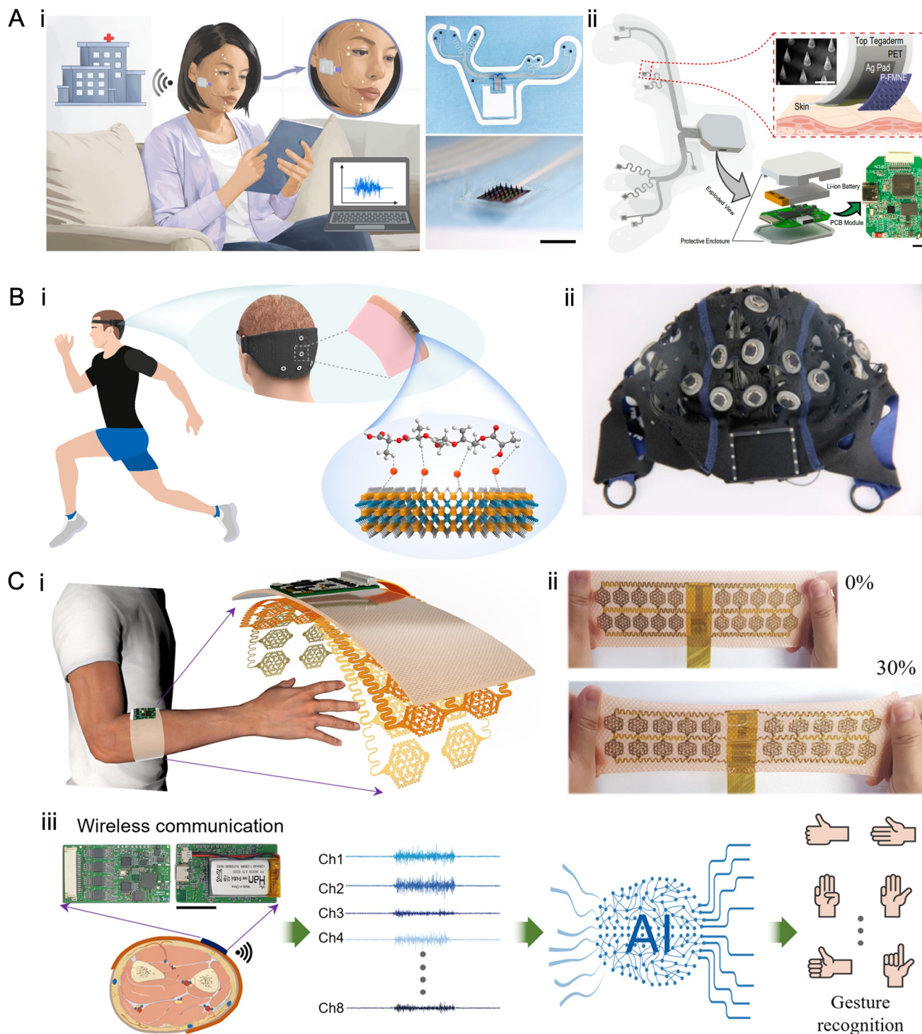
Fig. 9 MN wearable devices for electrophysiological signal monitoring. (A) Integration of MN electrodes with flexible electronics for facial biosensing: (i) illustration of a soft wearable electronic mask for facial EMG monitoring; (ii) design of the electrode component and PCB module. Reproduced from ref. 122 under the CC-BY 4.0 license. (B) Integration of MN electrodes as brain-computer interfaces with an EEG scalp cap: (i) Mxene MN electrode as a brain-computer interface; (ii) the wearable EEG cap. Reproduced with permission from ref. 117. Copyright 2025, American Chemical Society. (C) Integration of MN electrode devices with artificial neural networks for enhanced bioelectrical signal interpretation: (i) wearable EMG sensor for real-time monitoring of EMG signals; (ii) original and stretched wearable EMG sensor; (iii) gesture recognition by a graph neural network using transmitted data from the EMG sensor. Reproduced from ref. 126 under the CC-BY 4.0 license.

structure not only enhanced mechanical flexibility but also mitigated metal layer peeling (Fig. 8C, iii). 121