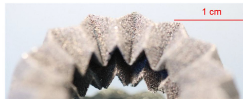
Fig. 1 Printed PM of novel shape with cooling channel.