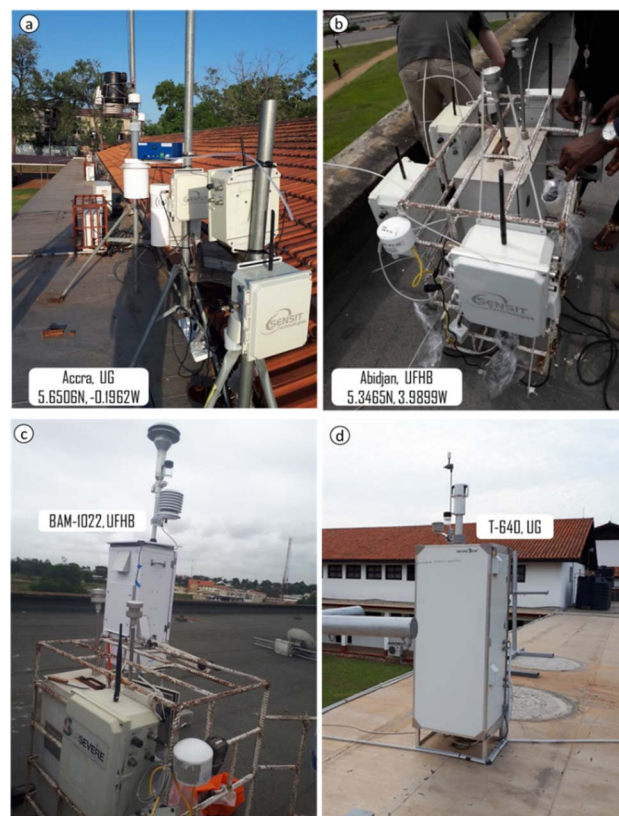
Fig. 2 Pictures of monitors, (a) RAMPs at UFHB, (b) RAMPs at UG, (c) collocation of BAM-1022 and RAMPs at UFHB, (d) Teledyne T-640 at UG.

In Accra, RAMP-1033 and RAMP-1034 were deployed from 10 March 2020 to 31 March 2021 at the atomic interchange (AI) and Kwashieman Trinity Presbyterian Church (KTPC) respectively. These two RAMPs were then later collocated for calibration with