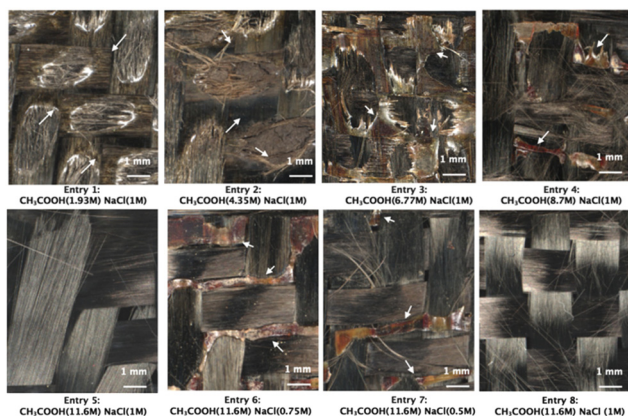
Fig. 1 Light microscope images of recycled CFs from entries 1–8, showing matrix residue (white arrows).