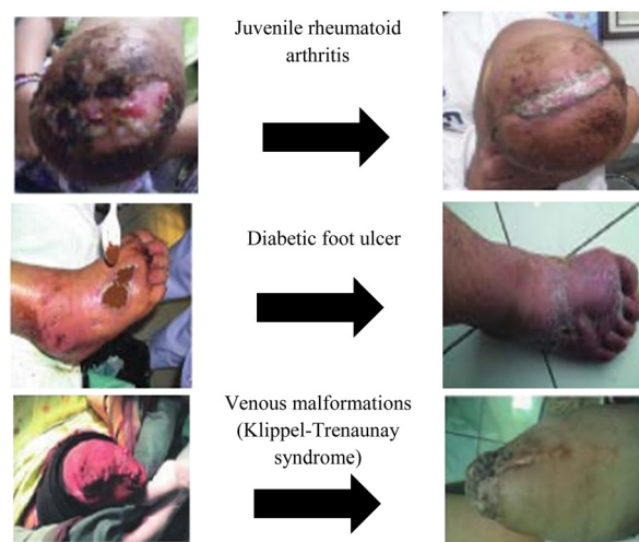
Fig. 3 Wound healing by coffee through human study. 81 Adopted with permission from ref. 81.

Histopathological studies on thirty-six New Zealand white rabbits supported the wound healing activity of green coffee bean extracts. Shahriari et al. 94 studied the green coffee bean extract in a full-thickness wound model. Coffee (10%) increased the wound closure rate, exhibited a shorter epithelialization