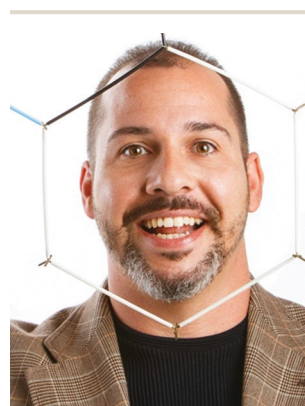
Luis Miguel Azofra

Ellman's sulfinamide represents as an industrially relevant reagent, frequently used as an ammonia surrogate in the synthesis of enantiopure primary amines. 11 This transformation typically requires three chemical steps, i.e. , stoichiometric