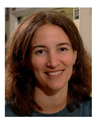
Heather D. Maynard

Initially, PEG was synthesized by reacting mPEG (monomethoxy-PEG) of molecular weight (M_w) 5000 with cyanuric chloride, forming PEG dichlorotriazine. In this approach, one of the two remaining chlorines on PEG dichlorotriazine is displaced by nucleophilic amino acid units such as lysine, serine, tyrosine,