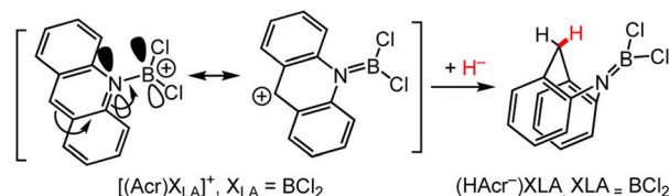
Scheme 11 Synthesis of (HAcr - )X LA , where X LA = BCl 2 + ; X LA may also be other groups as indicated in the main text. (Left) Resonance forms of [(Acr)BCl 2 ] + and (right) (HAcr - ){BCl 2 } + , the HT product, which is stabilised by the N Acr -B multiple bonding. 102

A handful of examples exist where a catalytic HT reaction is enabled by regeneration of a DHP - electrochemically; these have mostly been studied within the past decade and involve organic DHP - s. 18,19,103 The applied potentials needed to drive these catalytic reactions vary greatly depending on the solvent