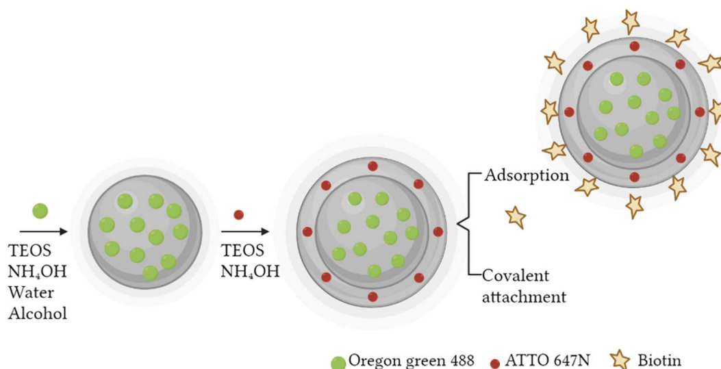
Fig. 1 Schematic representation of two-cycle Stöber method (created by Biorender).

A fast, simple, and reproducible method for the synthesis of dual-color SiO 2 NPs is proposed herein. The two-cycle Stöber