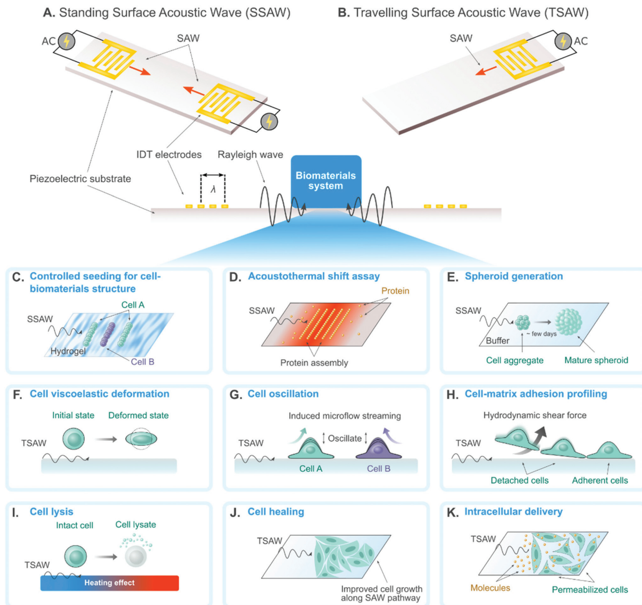
Fig. 1 Schematic illustration of the working principles and representative applications of SAW actuators for biomaterials. Two mode of operations for SAW actuators are standing surface acoustic wave (A) and travelling surface acoustic wave (B). Applications of SAW actuators for biomaterials include cell seeding in hydrogel (C), protein thermal shift assay using SAW (D), long-term cell aggregation for tumor spheroid generation (E), cell deformation in suspension (F), adherent cell-induced microstreaming during SAW exposure (G), SAW-induced flow for profiling cell–substrate interaction (H), cell lysis (I), SAW-induced cell growth promotion (J), and intracellular delivery (K).

to the trapping of most acoustic energy adjacent to the interface between the piezoelectric substrate and the fluid. The acoustic energy dissipates into the fluid to induce streaming effect and exert forces on any objects inside the fluid boundary without physical contact. Since then, SAW actuators have been widely used in microfluidic control and micromanipulation. Recently, various systems of small biomaterials have also been extensively studied with SAW actuators. In this section, different emerging SAW actuators for biomaterials will be introduced.