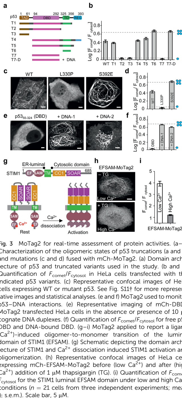
Fig. 3 MoTag2 for real-time assessment of protein activities. (a–d) Characterization of the oligomeric states of p53 truncations (a and b) and mutations (c and d) fused with mCh-MoTag2. (a) Domain architecture of p53 and truncated variants used in the study. (b and d) Quantification of F_{\text{comet}}/F_{\text{cytosol}} in HeLa cells transfected with the indicated p53 variants. (c) Representative confocal images of HeLa cells expressing WT or mutant p53. See Fig. S11† for more representative images and statistical analyses. (e and f) MoTag2 used to monitor p53–DNA interactions. (e) Representative imaging of mCh-DBD-MoTag2 transfected HeLa cells in the absence or presence of 10 \mu\text{g} cognate DNA duplexes. (f) Quantification of F_{\text{comet}}/F_{\text{cytosol}} for free p53 DBD and DNA-bound DBD. (g–i) MoTag2 applied to report a ligand ( \text{Ca}^{2+} )-induced oligomer-to-monomer transition of the luminal domain of STIM1 (EFSAM). (g) Schematic depicting the domain architecture of STIM1 and \text{Ca}^{2+} dissociation induced STIM1 activation and oligomerization. (h) Representative confocal images of HeLa cells expressing mCh-EFSAM-MoTag2 before (low \text{Ca}^{2+} ) and after (high \text{Ca}^{2+} ) addition of 1 \mu\text{M} thapsigargin (TG). (i) Quantification of F_{\text{comet}}/F_{\text{cytosol}} for the STIM1 luminal EFSAM domain under low and high \text{Ca}^{2+} conditions ( n = 21 cells from three independent experiments; mean \pm s.e.m.). Scale bar, 5 \mu\text{m} .

when we transfected DBD-expressing HeLa cells with liposomes containing its cognate DNA duplexes, p53-DBD changed its oligomeric state from monomer to tetramer, as judged by the comet intensities under the corresponding conditions (Fig. 3e and f). A similar scenario was visualized in monomeric HSF1-DBD when complexed with its cognate DNA, except that it underwent a monomer-to-trimer transition (Fig. S12†). In aggregate, we demonstrated that MoTag2 could be exploited to not only identify domains that are essential for protein self-association but also report changes in protein quaternary structure upon formation of protein–DNA complexes.