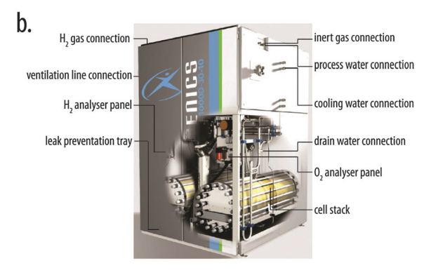
Fig. 1 (a) A schematic illustration of a simple U-tube configuration for water electrolysis. Voltage penalties (overpotentials) increase the total voltage required to operate the system at a given rate relative to the thermodynamically required potential, and include the kinetic overpotentials associated with the hydrogen-evolution and oxygen-evolution reactions (\eta_{\text{HER}} \text{ and } \eta_{\text{OER}}, \text{ respectively}), \text{ the concentration overpotential } (\eta_{\text{con}}), \text{ and } ohmic resistance loss ( \eta_{\text{ohm}} ). The total operating voltage of the system is given by the sum of the thermodynamic voltage for the water-splitting reaction and the total overpotential, \eta_{\text{total}} , for the system. (b) A schematic illustration of a commercially available (Hydrogenics) alkaline water electrolyzer with auxiliary components.7

transfer between most metal electrodes and a species in solution are slow for complex, multi-step electrochemical reactions, including reactions as simple as the two-electron reduction of two protons to form a single molecule of H<sub>2</sub>. <sup>12,13</sup> The overpotential partially overcomes the activation barrier for such processes, with the exact partitioning of the potential between the liquid and the kinetic barrier depending on the details of the system. Assuming an Arrhenius-type relationship for the interfacial charge-transfer kinetics yields an exponential relationship between the overpotential and the rate, or current density, j, of the reaction of interest: