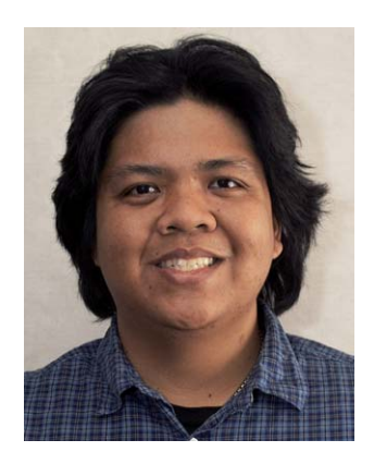
Steevens N. S. Alconcel

The main objective of using polymers in drug delivery is to stabilize and improve the therapeutic activity of the standalone drug.<sup>4-6</sup> The non-ionic, hydrophilic PEG provides a steric shield for conjugates from recognition by the patient's immune system and effectively increases the size of the biomolecule,<sup>7</sup> thereby reducing clearance from the bloodstream.<sup>8</sup> By increasing the half-life of the protein drug, the dosage frequency is reduced.<sup>9</sup> Since most protein drugs need to be injected, this result is significant. Increased duration of pharmacological activity, reduction of toxic side effects, and increased quality of life due to controlled, timed release are several positive results attributed to PEGylation. The detailed pharmacokinetics of PEGylated drugs have been recently reviewed.<sup>10</sup> The dosage schedule and