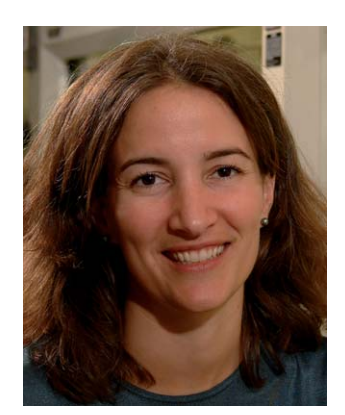
Heather D. Maynard

Initially, PEG was synthesized by reacting mPEG (monomethoxy-PEG) of molecular weight (M_w) 5000 with cyanuric chloride, forming PEG dichlorotriazine. In this approach, one of the two remaining chlorines on PEG dichlorotriazine is displaced by nucleophilic amino acid units such as lysine, serine, tyrosine,