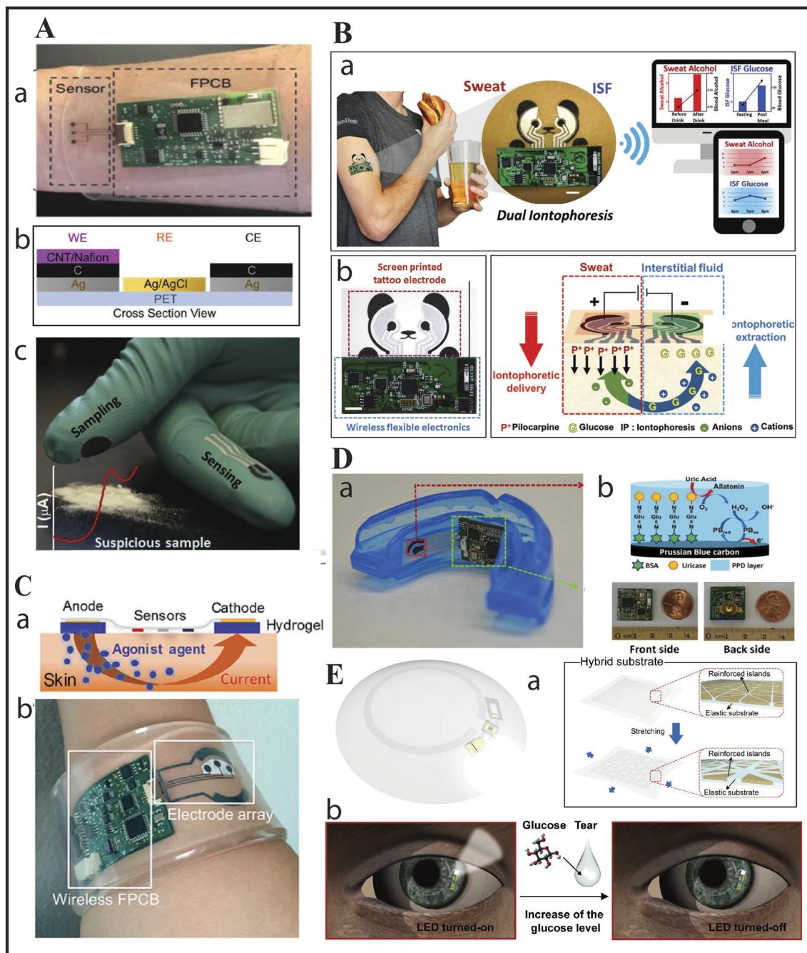
Fig. 1 Body wearable devices: (A) voltammetric sensors: (a) as sweat patch regulating the drug methylxanthine; (b) schematic of caffeine sensing band; and (c) fentanyl detecting gloves with square-wave voltammetry. Reproduced from ref. 6 with permission from Wiley-VCH, copyright 2018 & reproduced from ref. 7 with permission from Elsevier, copyright 2019. (B) Another wearable dual iontophoretic biosensor based on a tattoo, to simultaneously detect glucose and sweat: (a) dual iontophoretic biosensor for ISF glucose and sweat alcohol detection on a human subject with data being transmitted wirelessly to a mobile device; (b) screen printed electrode with wireless circuit on which the iontophoretic operation takes place. Reproduced from ref. 8 with permission from Wiley-VCH, copyright 2018. (C) Illustration of drug delivery via the iontophoretic technique: (a) and (b) showcase an integrated wristband for the detection of sweat via iontophoretic technique (sensors based on detecting cystic fibrosis electrochemically). Reproduced from ref. 9 with permission from the National Academy of Sciences, copyright 2017. (D) (a) Biosensor as a mouthguard with wireless circuit board integrated to an amperometric genosensor for detection of UA; (b) carbon WE modified with Prussian Blue attached to Uricase via BSA for detection of UA in saliva and photos showing wireless circuits from front and back side. Reproduced from ref. 10 with permission from Elsevier, copyright 2015. (E) (a) Schematics of a smart contact lens composed of a hybrid substrate which is embedded with stretchable conductors and functional devices to detect glucose in human tears in real-time; (b) schematics showing working of the lens by wireless transmission of power which activates the LED pixel and thus the sensor for detecting glucose. As the glucose level in the tear reaches a threshold level the LED pixel switches off. Reproduced from ref. 11 with permission from the American Association for the Advancement of Science, copyright 2018.