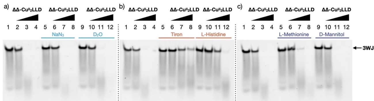
Fig. 5 20% native PAGE showing the cleavage profile of the \Delta\Delta\text{-Cu}^{\text{II}}_2\text{LLD} in the presence of ROS scavengers: (a) \text{NaN}_3 and \text{D}_2\text{O} ; (b) tiron and L-histidine; (c) L-methionine and D-mannitol. Lane 1–4: control (no scavenger). Lanes 5–8: (a) \text{NaN}_3 ; (b) tiron; (c) L-methionine. Lanes 9–12: (a) \text{D}_2\text{O} ; (b) L-histidine; (c) D-mannitol. Lanes 1, 5, 9: 3WJ control. Lanes 2, 6, 10: 1 eq. \Delta\Delta\text{-Cu}^{\text{II}}_2\text{LLD} . Lanes 3, 7, 11: 5 eq. \Delta\Delta\text{-Cu}^{\text{II}}_2\text{LLD} . Lanes 4, 8, 12: 10 eq. \Delta\Delta\text{-Cu}^{\text{II}}_2\text{LLD} . All lanes (excluding controls) contain Na-L-ascorbate (10 eq. to \Delta\Delta\text{-Cu}^{\text{II}}_2\text{LLD} ).

To this point we have demonstrated that the \Delta\Delta\text{-Cu}^{\text{II}}_2\text{LLD} readily forms in solution, its stability in aqueous environments, and that \Delta\Delta\text{-Cu}^{\text{II}}_2\text{LLD} can selectively bind and damage 3WJ in vitro . Next, in cellulo studies were performed to investigate the ability of the \text{Cu}^{\text{II}} helicate to selectively target DNA replication centres ( i.e. , 3WJs in the cell nuclei). Preliminary experiments indicated, as was the case with \text{Fe}^{\text{II}} analogues, 50 that a TAMRA-labelled \text{Cu}^{\text{II}} peptide helicate, \Delta\Delta\text{-Cu}^{\text{II}}_2\text{TAMRA-LLD} (Fig. S2†), did not internalise in Vero cells. However, it readily translocated in digitonin-treated cells where it showed a diffused