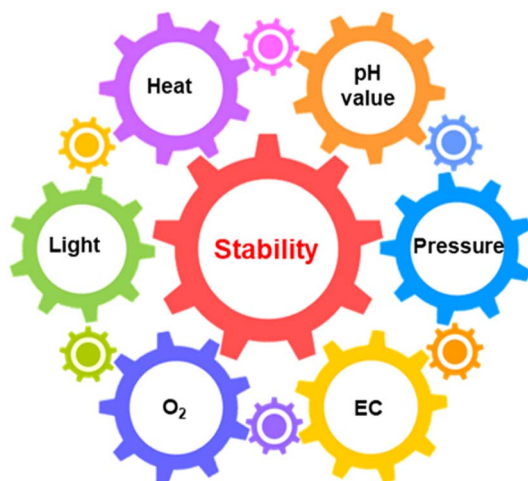
Fig. 7 Schematic illustration of the relationship between the photo(electro)catalyst stability and various environmental factors. EC: electrolyte composition.

The degradation process is the interaction between active materials and environmental stimulations, which mainly include light intensity, O 2 , pressure, reaction solution and temperature for the solar-driven water-splitting reaction. 4 In turn, proper control of the operational environment is possible to stabilise the photocatalysts/photoelectrodes. 15 Thus, environmental stimulations should be analysed together with active materials when investigating the deactivation of photocatalysts and photoelectrodes. Generally, environmental stimulations do not work independently but are affected to a greater or lesser extent by each other (Fig. 7). 20,29,67 The deep understanding of how environmental stimulations influence the stability of catalyst materials is essential to guide the design of durable PC/PEC devices.