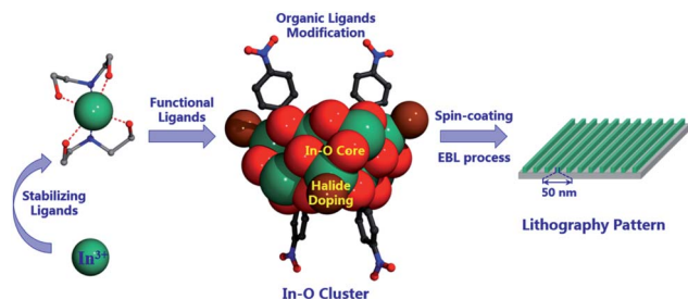
Scheme 1 Illustration of the assembly of the atomically precise \text{In}_{12} -oxo clusters with chemical modification and patterning evaluation.