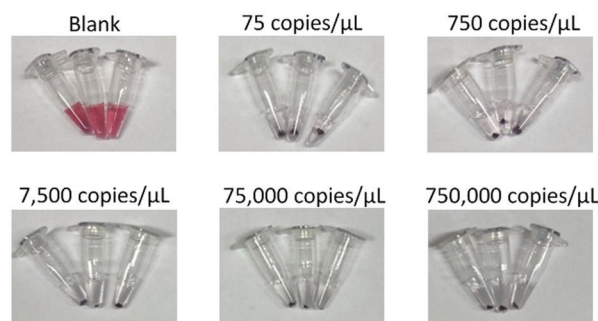
Fig. 3 Representative images from triplicate analysis of samples containing varying concentrations of the SARS-CoV-2 viral RNA. The N gene was detected. 5 μL of the viral RNA sample was used. The tubes labelled blank contained all reagents but no RNA sample (negative control).

sufficient for RT-LAMP to amplify low copies of the viral RNA. We then used the CRISPR/Cas12a-mediated AuNP aggregation assay to test these solutions (Fig. 3). The color of the negative control solution that contained all the reagents but no viral RNA remained red, whereas the color of all positive sample solutions changed from red to purple and then to nearly colorless after centrifugation for 10 s. Aggregated AuNP pellets