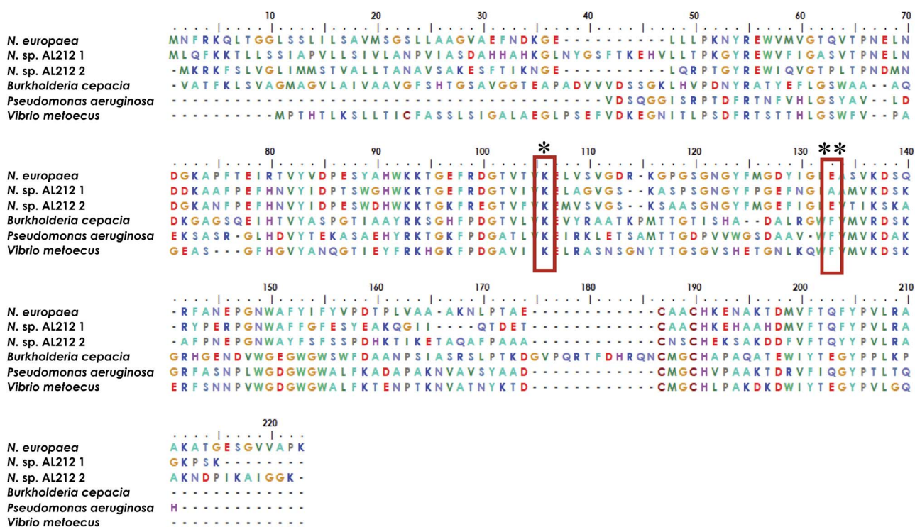
Fig. 9 Sequence alignment generated using MEGA X software 35 showing homology between cyt P460 genes from N. europaea , the two cyt P460 sequences from N. sp. AL212 , and genes predicted from mammalian pathogenic bacteria Burkholderia cepacia , Pseudomonas aeruginosa , and Vibrio metoecus . * indicates conserved Lys cross-link, ** indicates the critical second-sphere Ala/Glu/Phe residue.

residue in position 131, as shown in the present work. This theory accords with the evolutionary trajectory of HAO into oxidative chemistry. HAO belongs to a larger family of multi-heme c enzymes, including hydrazine oxidoreductase (HZO), octaheme cytochrome c nitrite reductase (ONR), and penta-heme cytochrome c nitrite reductase (NrfA). It is believed that the presence of additional protein cross-links to the catalytic heme are what distinguish enzymes with oxidative chemistries from those with reductive chemistries. 36,37 Comparative homology of currently annotated cyt P460 sequences would suggest distinct classes of cyt P460 which contain different residues (e.g. glutamate/aspartate, alanine, phenylalanine, Fig. 9) in this crucial second sphere position. In fact, the Nitrosomonas sp. AL212 genome contains two cyt P460 sequences (Fig. 9), one that contains Ala131 (the focus of this study) and one that is predicted to have a glutamate in this position (though the latter also contains a CXXCH heme-binding motif different from the CAACH motif observed in the former AL212 cyt P460 and N. europaea cyt P460). 38 It is likely that this second cyt P460 behaves in a manner similar to N.