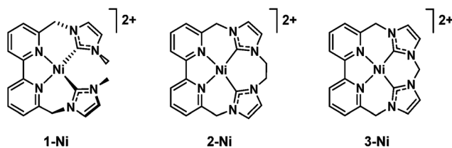
Fig. 7 Nickel(II) catalysts supported by non-macrocyclic and macrocyclic bipyridyl-NHC ligands. Reprinted with permission from ref. 117. Copyright 2018, Royal Society of Chemistry.

A nickel complex supported by a pincer-type carbene-pyridine-carbene ligand also exhibited high selectivity for the electrocatalytic reduction of CO 2 to CO over proton reduction. 118 A series of Ni II macrocycle complexes structurally similar to [Ni(cyclam)] 2+ (cyclam = 1,4,8,11-tetraazacyclotetradecane) also act as selective electrocatalysts for CO production over H 2 at a mercury pool working electrode in an aqueous solution. 119-121 At pH 5, with an applied potential of -0.96 V vs. NHE (overpotential of -0.55 V), the Ni complexes are efficient, having high faradaic efficiencies for the selective reduction of CO 2 to CO. 118 Hg provides favorable noncovalent dispersive interactions with the cyclam ligand to destabilise the poisoned CO-bound form of the catalyst, leading to enhanced catalytic reactivity. 122 The binding of CO 2 to Ni(II) complexes has been