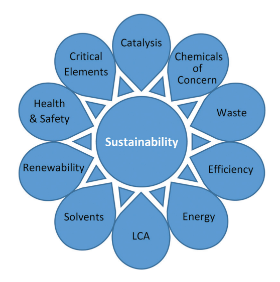
Fig. 1 Summary of the key parameters covered by the metrics toolkit.

A gap analysis was performed to compare current methods against the lifecycle of a typical active pharmaceutical ingredient (API). Subsequently, a number of 'key parameters' were identified which were chosen to cover a comprehensive range of relevant issues regarding the synthesis of chemical products. In this way, the focus was expanded significantly from simply adopting a traditional mass inputs/outputs approach. A summary of the key parameters is shown in Fig. 1. In order to be included in the toolkit, parameters needed to meet the criteria of being able to be practically and consistently measured/ assessed in a laboratory based setting. Following an in-depth critical analysis, favoured quantitative metrics were selected to cover the key parameters. These were supplemented by additional qualitative parameters (where no straightforward calculation is possible).