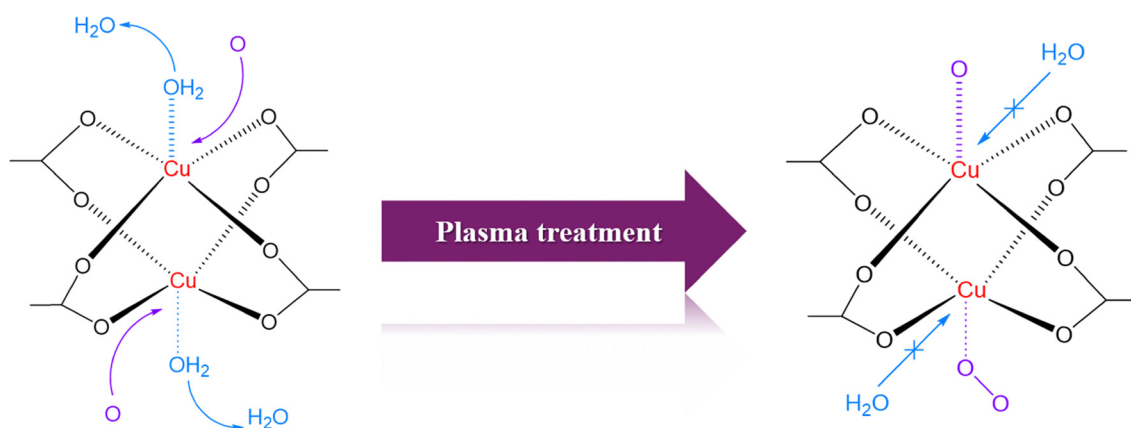
Fig. 7 Proposed \text{O}_2 plasma treatment mechanism of pore activation and protection. Reproduced from ref. 71 with permission from RSC, copyright 2017.

The theoretical and practical aspects of the nucleation and crystal growth process of the DBD plasma-assisted MOFs synthesis method have been developed by scientists. In hydrothermal, as a conventional synthesis method, the heat increases with time, so the concentration of precursors reaches a certain level. At this point, crystals nucleate on dust particles or near the reactor walls. 73,74 However, in the DBD plasma-assisted method, a wide range of micro-discharge channels contain photons, active neutral particles, and charged particles that have been uniformly profiled on the surface of the solution film. The energy of the charged particles can be several electron volts (and the temperature in the channels is hundreds of Kelvin) due to the strong influence of the electric field. When these particles collide with the solvent, their energy is released, forming several localized superheat spots on the solution film surface. These superheat spots induced the reaction to form a precursor at atmospheric pressure and room temperature. Therefore, the precursor concentration increased with circulation, leading to nucleation growth and higher yields. 75