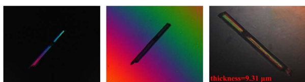
Fig. 5 Experimental birefringence at 546 nm for \text{Pb}_2(\text{SeO}_3)(\text{SiF}_6) .

The UV-vis-NIR diffuse reflectance spectra indicate that the \text{Pb}_2(\text{SeO}_3)(\text{SiF}_6) compound exhibits a UV cutoff edge at 247 nm, accompanied by a bandgap of 4.4 eV (Fig. S4†). Notably, this bandgap is significantly higher than those observed in previously reported lead-based compounds such as \text{Pb}_3\text{SeO}_5 (3.3 eV), 53 \text{CdPb}_8(\text{SeO}_3)_4\text{Br}_{10} (3.32 eV), 45 \text{Pb}_2\text{Bi}(\text{SeO}_3)_2\text{Cl}_3 (3.45 eV), 20 \text{Pb}_2\text{NbO}_2(\text{SeO}_3)_2\text{Br} (3.17 eV), 54 and \text{Pb}_3(\text{SeO}_3)\text{Br}_4 (3.35 eV). 55 This significant bandgap can be primarily attributed to the contribution of the perfluorinated group \text{SiF}_6 . Combined with the IR spectrum, the transparency range for \text{Pb}_2(\text{SeO}_3)(\text{SiF}_6) powder samples is from 0.25 to 12.6 \mu\text{m} (Fig. 4). However, considering the potential deviation in infrared cutoff edge due to multi-