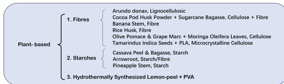
Fig. 1 Plant-based biodegradable packaging materials.

Fontes-Candia et al. 91 demonstrated the innovative utilisation of Arundo donax lignocellulosic waste biomass in the production of highly porous and bioactive aerogels. These aerogels exhibit remarkable water and oil sorption capacities, comparable to those of chemically modified nanocellulose aerogels, thereby highlighting their functional effectiveness. Additionally, the study augmented these aerogels with significant antioxidant properties by incorporating extracts from A. donax biomass, particularly the stem extract generated through heating (S-HW), which is rich in polysaccharides and polyphenols. Furthermore, their ability to reduce colour loss and lipid oxidation in red meat during refrigerated storage positions these aerogels as promising candidates for bioactive food packaging materials.