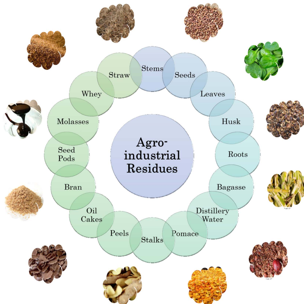
Fig. 4 Different agro-industrial residues used as substrate during biosurfactant production.

5.1.1. Vegetable oil and (oil) wastes. A large amount of waste residues formation occurs during the oil extraction in various oil industry. These left over products includes oil cakes, oil soap stocks, by-products rich in fat content, semisolid and water soluble effluents, fatty acid residues etc. 64