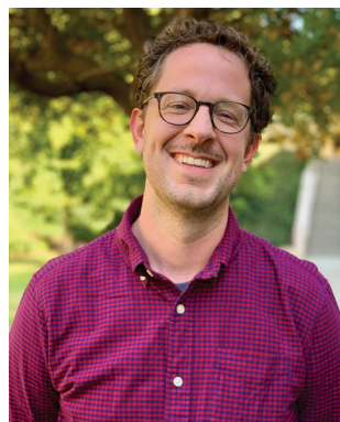
Randy P. Carney

Given that released EVs exhibit composition reflective of their parent cells in response to local external stimuli, they represent a rich source of potential biomarkers with great potential for clinical application. 1,4–11 Yet many challenges remain before that potential can be reached, especially in the choice of EV isolation methodology, which has a known effect on the quality and content of the isolated product. 2 In addition to vesicles, isolates may contain a variety of additional nanoscale biomolecular assemblies, including ribonucleoprotein par-