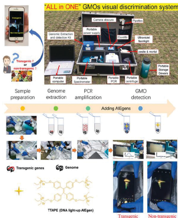
Scheme 1 Scheme for visual discrimination of transgenic and non-transgenic food using DNA-binding AIEgens and a brief introduction of the "ALL in ONE" GMO portable detection system. The portable detection system consisted of the following parts: genomic extraction and detection kit (genomic extraction reagents, mini-column, PCR primers, AIEgens, etc. ); portable power supply; camera obscura (for visual detection); cuvette; pipettes; ultraviolet flashlight (for visual detection); mortar and pestle (for sample preparation); portable storage dewars (for sample preparation); portable centrifuge (for sample preparation); portable PCR device (for genomic sequence replication and amplification); portable spectrometer (for wavelength detection); portable computer (for data acquiring and analysis).

As shown in Scheme 1, the "ALL in ONE" GMO visual discrimination system consists of a genomic extraction kit, detection kits, portable power supply, portable centrifuge, portable PCR device, portable spectrometer, portable storage dewar, portable computer, and a mortar and pestle. TTAPE (the mass spectrometry results could be found in Fig. S1, ESI † ) showed the best performance towards a guanine-rich DNA strand ( e.g. , G-quadruplex structure formed by human telomeric DNA sequences) via electrostatic attraction due to the perfect structural match. Therefore, it is