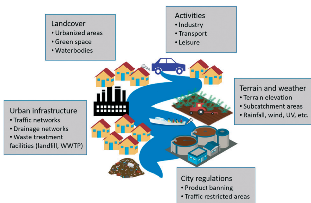
Fig. 1 Representation of the main factors influencing the emission of pollutants, including ENPs, in urban environments.