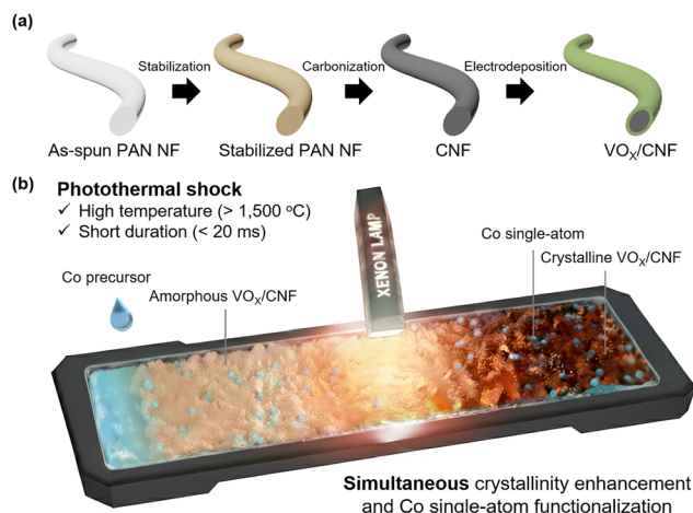
Fig. 1 (a) Schematic illustration of fabrication of amorphous VO x on CNF. (b) Schematic illustration of the synthesis of Co/VO x /CNF via ultrafast photothermal shock process, highlighting the simultaneous crystallinity enhancement and Co single-atom anchoring.