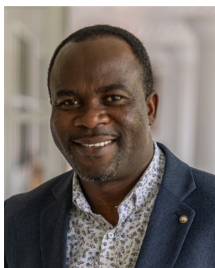
Nelson Y. Dzade

We performed first-principles calculations based on DFT as implemented in the Vienna ab initio simulation package (VASP), a plane-wave-based code. 36,37 The projector augmented wave (PAW) pseudopotentials were employed to describe the