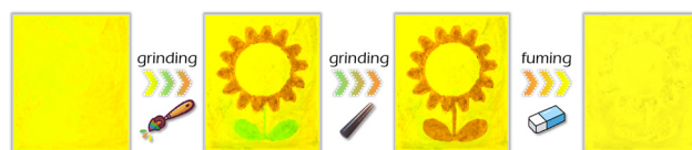
Fig. 4 Ink-free writable paper application of gold(i)-containing AIEgen 2 under 365 nm UV light.

In summary, two novel TPE-functionalized carbazole-based mononuclear gold(i) complexes featuring different phosphino-type auxiliary ligands were developed. It is unprecedented that two newly reported gold(i) complexes possessing phosphino ligands can simultaneously display AIE and tricolored mechanofluorochromic characteristics. Noticeably, a gold(i)-containing AIEgen 2 with the anisotropic force-triggered high-contrast three-color fluorescence switching nature was successfully