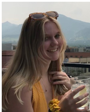
Rachel S. Cohen

There are many ongoing studies developing bNPs for uses including catalysis, 8 solar photoconversion, 9 antimicrobial therapy, 10,11 and theranostic ( i.e. , combined therapeutics and