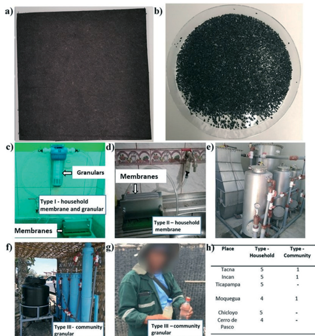
Fig. 2 (a) Photograph of the filtration membrane. (b) Photograph of the granular media. (c) Type I – household filtration unit (membrane and granular media). (d) Type II – household filtration unit (only the membrane). (e) Type III – community filtration unit in Torata. (f) Type III – community filtration unit (only granular) in Incan. (g) Water samples collected from the Incan area with high turbidity (sample in the left side: before filtration; sample in the right side: after filtration) and (h) the number of the household and community installations in the selected areas.

supply systems from April 2019 until July 2020. The samples were collected directly from the inlet and outlet of the filtration process and stored without any reagents. All the samples have been acidified using 0.1 M \text{HNO}_3 before analysis by AAS. The samples were analyzed for the residual arsenic concentration before and after the filtration at ETH Zurich using atomic absorption spectroscopy on a AAS240Z Zeeman graphite furnace (GTA 120) equipped with a PSD 120 programmable sample dispenser. In this study we measured the total arsenic content without distinguishing As (III) and As (V) in the water, before and after the treatment. The measurements were performed in triplicate, and the results were averaged. A separate calibration was done by measuring the standard solutions with various concentration regimes. The physicochemical parameters of the water before and after filtration is shown in ESI Table S2.†