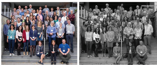
Photos of the Authors from the UV4Plants 2 nd Network meeting in Bled, Slovenia. (A. visible light, B. UV-A image)

This article was authored by participants in a discussion on the future of plant-UV research at the 2 nd Network Meeting of UV4Plants ( https://uv4plants.org/about/ ), the International Association for Plant UV Research, in Bled Slovenia, April 2018. UV4Plants was established in 2014 following a successful EU COST Action UV4growth, to promote excellence in plant UV research. UV4Plants functions as a forum for photobiologists in plant UV photobiology to collaborate and disseminate research findings with each other and for application beyond academia. As well as leading scientists in plant biology, graduate students are well represented, as reflected in the authorship of this Perspective.