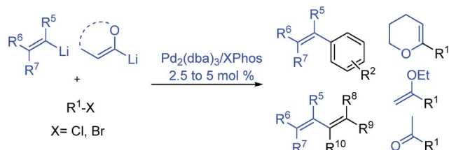
Scheme 1 Palladium catalysed cross-coupling of alkenyllithium reagents.