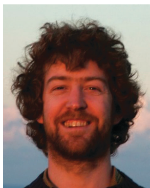
Matthew A. Watson

in Fig. 2. Briefly, molecular shuttles flip between multiple states under thermodynamic control as a result of Brownian motion. The result is a time-averaged Boltzmann distribution between the states at equilibrium, with the position of the equilibrium being governed by the relative free energies of those states under differing conditions. A switch differs from a stochastic shuttle and can be defined as having machine-like properties due to the possession of at least two kinetically trapped states that can only be interconverted by the application of a specific stimulus. Work can be extracted from such a system when switching allows the return from a kinetically trapped state to a