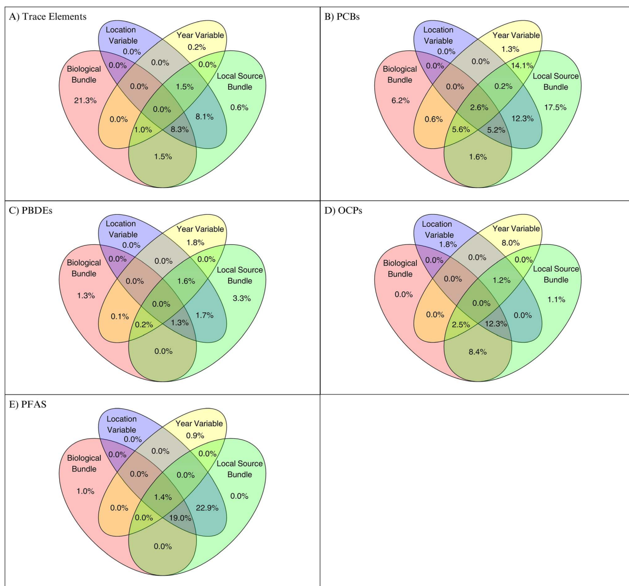
Fig. 2 Venn diagrams of the variation partitioning of the contaminant data explained by biological variable bundle (age, sex, \delta^{13}\text{C} , \delta^{15}\text{N} and size) (red), sampling location (blue), sampling year (yellow) and local source variable bundle (human population size, power source, mine, wastewater facility, solid waste disposal, DEW line sites, airports) (green). Values (%) represent the contribution of explained contamination variation by each variable/bundle. Size of circles not representative of contribution.

The forward selected db-RDA results showed that seal biological data, community location, local source variables and sampling year explained a considerable portion of the ringed seal contaminant variation. These models explained 41.0% of the variation in trace element concentrations in ringed seals ( R^2 adjusted for number of variables and sample size), 45.1% for PFAS levels, 8.4% for PBDEs, 31.8% for OCPs, and 65.8% for PCBs. Results of forward selected variables included in each db-