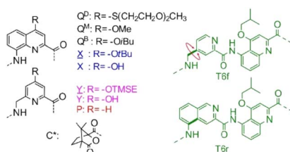
Fig. 1 Structure of Q D , Q B , Q M , X, Y, P, T6f and T6r monomers as well as N-terminal chiral C* group. X and Y are the hydroxy-protected precursors of X and Y, respectively. TMSE = 2-trimethylsilylethyl. Reproduced from ref. 15 with permission from the Royal Society of Chemistry.

To design a unimolecular three-helix bundle based on the crystal structure of the parallel trimer, the authors had to address two distinct challenges. The first was to organize the helices in space for them to be connected from the N-terminus of a helix to the C-terminus of an adjacent helix, which requires the realignment of one of the three helices, from being parallel to the other two helices to being antiparallel. This was achieved by inverting both the orientation and the handedness of one of the helices, a well-known operation adopted in the design of \alpha -helical retro-inverso peptides, 16 and also used by the Huc group to design the PM/MP helix-turn-helix tertiary fold. 17 The resultant heterochiral trimolecular bundle was examined by molecular modeling, which confirmed the proper alignment of the helices and the placement of intermolecular hydrogen-bond patterns similar to those of the homochiral C_3 -symmetrical trimer. The other challenge was to design and synthesize linkers that covalently connect the three helices. Two distinct helix-helix connection strategies were envisaged, along with considering the rigidity of the linker to reduce the possibility of rearrangement and/or of introducing strain that may destabilize the tertiary structure, and examination using molecular modeling led to the design of two analogous turn units, T6f and T6r, that were synthesized and further examined (Fig. 1).