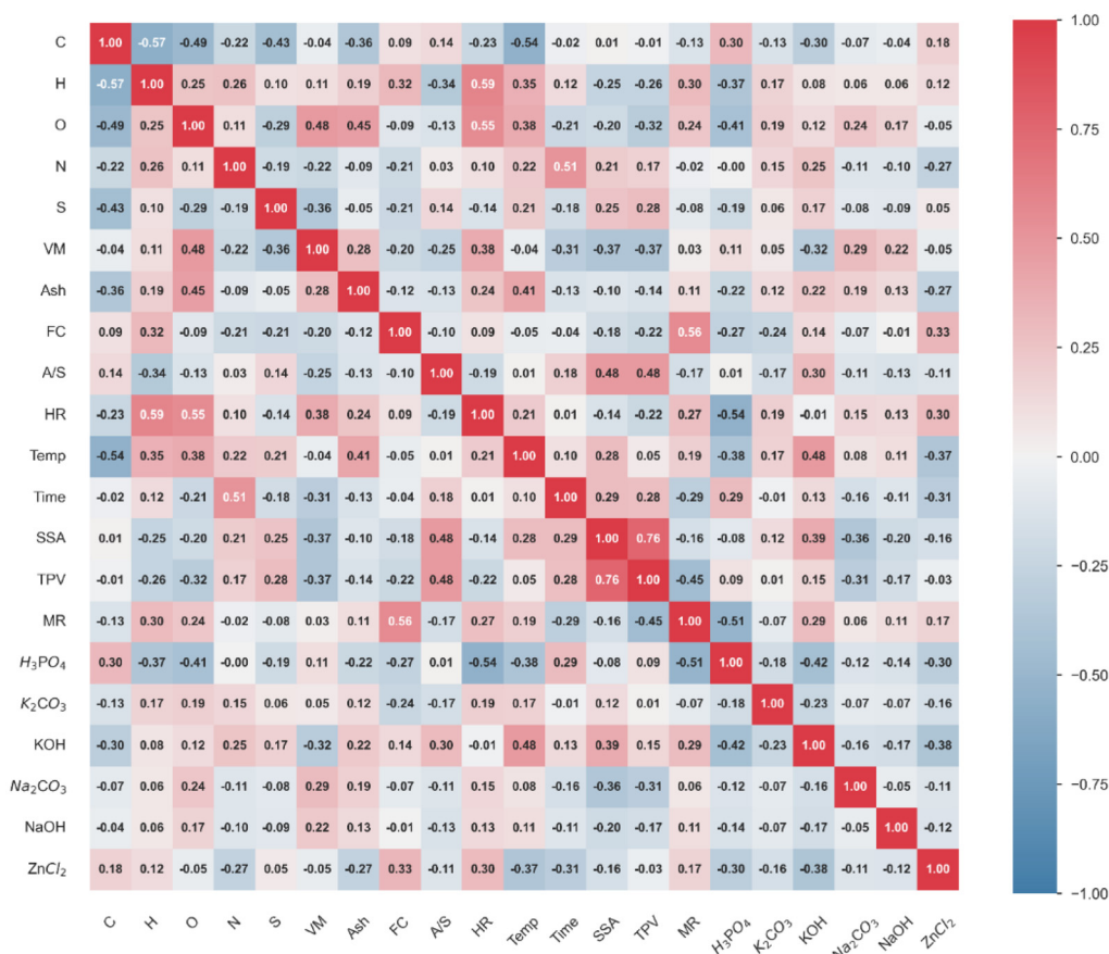
Fig. 2 Pearson correlation matrix among any two features of the cleaned dataset.

GBR). To evaluate its performance, we also trained traditional Gradient Boosting Regressor (GBR) and Random Forest (RF) models on the original dataset to predict the same targets: SSA, TPV, and Micropore MP. The prediction accuracy was assessed using two metrics: R^2 and RMSE for both the training and testing datasets. Table 1 summarizes the RMSE and R^2 values for these models across the various targets. For SSA, which had 10.82% missing values in the original dataset, the RF-based GBR model performed similarly to the other models