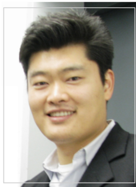
Kai A. I. Zhang

The presence of heteroatoms in a structural unit can serve as redox active sites for various electrochemical reactions to occur. Most pristine CTFs are semiconductors or insulators, but the introduction of conjugated molecules in their framework or doping with conductive components can significantly improve their conductivity, 16 ensuring their application in EESC systems. Furthermore, the unique structure of CTFs,