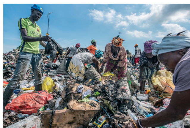
Fig. 2 Left: Operator moving waste after incineration in a public referral hospital, Sierra Leone. Right: People at public rubbish dump pick through the medical waste from a Community Health Post (CHC), Western Rural Area, Sierra Leone.

which are used in some low-resource settings, will not. In addition, when dumped in landfills (Fig. 2), plastics will persist for hundreds of years in the soil. The sustainability and safety of single-use POCTs could, to various degrees, be improved by technological solutions.