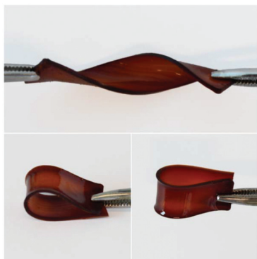
Fig. 3 Images of the cured poly(thioamide-benz-PPEO) film.

signals of the Jeffamine moiety are between 3.6 and 3.09 ppm, and those of the aliphatic protons are at 1.06–0.99 ppm. The FTIR spectrum of poly(thioamide-benz-PPEO) (Fig. S12†) further confirms the structure of the polymer. The IR spectrum shows the characteristic C–O band of the ether structure of Jeffamine at 1092\text{ cm}^{-1} . Moreover, the oxazine skeletal vibrations of C–H appear at ca. 920\text{ cm}^{-1} providing another evidence to support the presence of the ring structure in the main chain structure. In addition, the thioamide N–H stretching vibration is detectable at around 3270\text{ cm}^{-1} . In contrast, thiocarbonyl (C=S) is not visible due to the overlapping C–O bands of Jeffamine units.