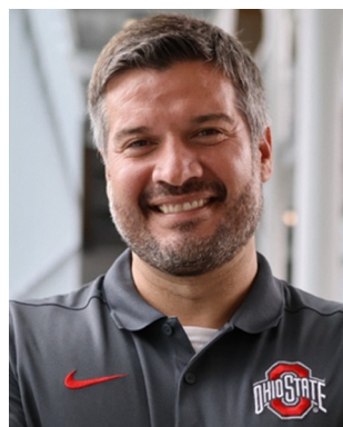
Carlos E. Castro

The most common approach to building dynamic structures leverages the precise geometric design capabilities of DNA origami to position short ssDNA segments at strategic sites to create flexible domains that connect multiple stiff dsDNA bundle components together. Short ssDNA regions ( \sim 1 to 4 nt) offer bending or rotational flexibility and are usually unpaired scaffold regions, 10 though they can also be unpaired staples connecting components. 11 Because DNA origami typically uses circular scaffolds, scaffold-based connections are often formed in pairs, while staple-based connections can form single linkages, though likely with lower assembly yield. These short ssDNA connections can provide rotational flexibility between components (Fig. 1(A)), and multiple such connections in a line can restrict motion to a single rotational axis (Fig. 1(B)). 12,13 This strategy underpins many DNA origami hinges, which is among the most commonly used dynamic designs. Longer scaffold connections when paired with short ones can tune joint flexibility, 14 while all-long ssDNA links allow for greater tethered motion between components (Fig. 1(C)). 15 Beyond flexible ssDNA joints, the design capability of DNA origami also enables constrained motion through the assembly of multi-component devices with complementary shapes. This often involves “staged” assembly to fit components together—such as inserting a cylinder into a tube 10 or